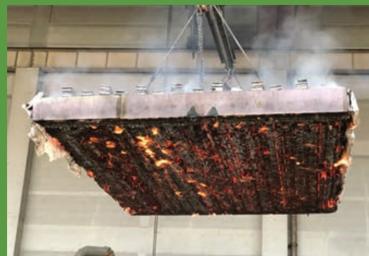
NLT Fire Resistance Test, Beijing

Regulatory barriers, capacity issues, buyer awareness and limited supply chains can all slow market growth. Since 2003, the market development program has addressed many capacity and demand-side issues. But barriers still exist. Building and fire codes continue to be updated, green building policies and standards continue to be advanced, and plant health and market access issues continue to be addressed. Ongoing stakeholder relations, supported with problem-solving expertise and a well-respected reputation in China as the “go to experts” for wood construction, helps the China team overcome these barriers and maximize opportunities for B.C. wood products.