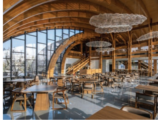
Chinese Tujia Pan-Museum (LEFT); Wuhan C&D Flower Mountain Impression Sales Centre (MIDDLE); Cocoon Restaurant at Gulao Water Village (RIGHT)