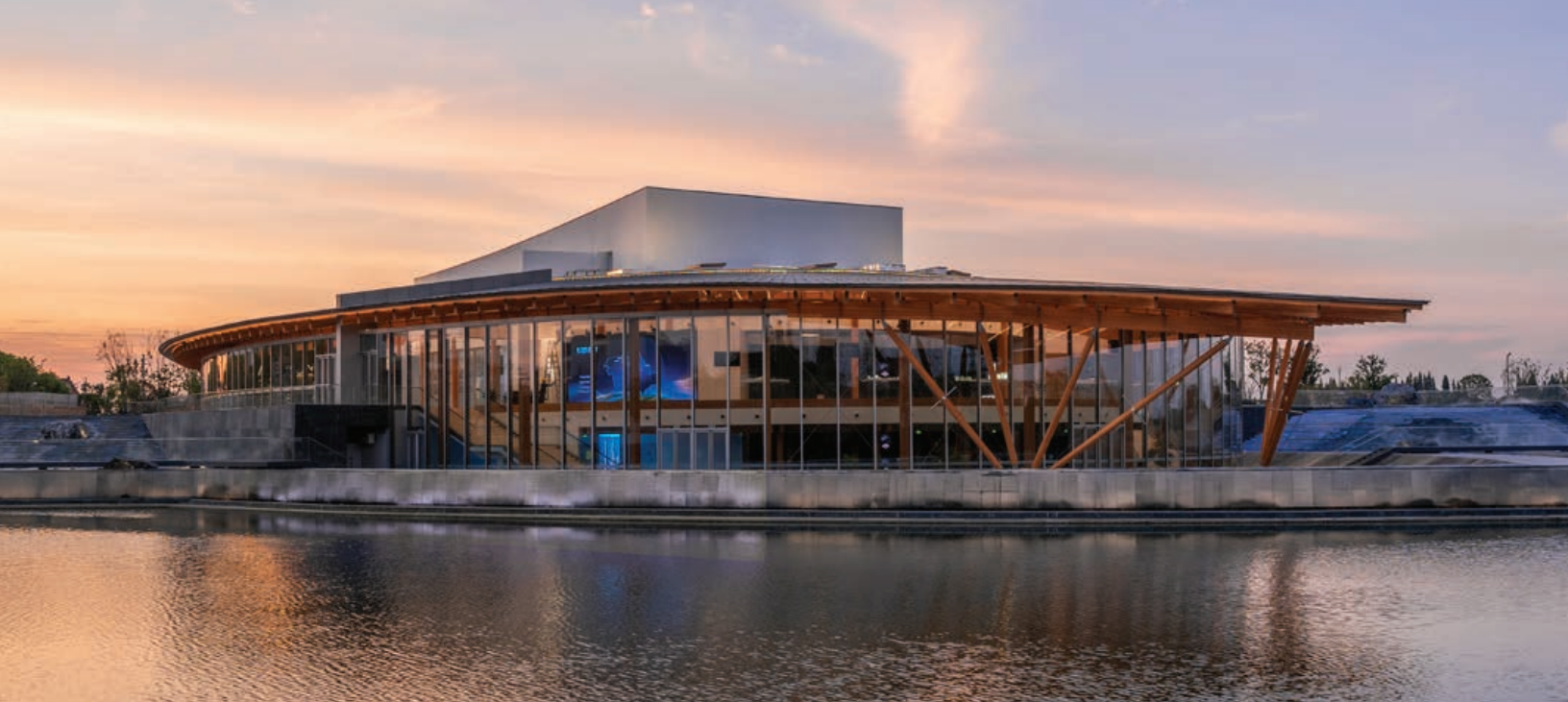
The YRD Integration Achievement Exhibition Hall