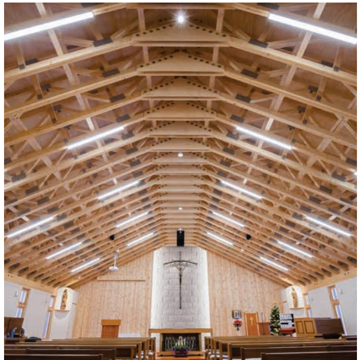
Catholic Macromania Church, Sapporo, Hokkaido

While the Japanese market has grown slowly, code changes are opening new markets for engineered wood products. Promotion of nail-laminated timber as a market entry strategy could establish Canada as a leading supplier, with current efforts following the successful market development strategy of the 2x4 sector in terms of working with regulators, offering research and technical support and providing trials, demonstrations and ongoing promotion. In an encouraging trend, nail plate truss use in non-residential applications grew to 35 percent market share in 2022.