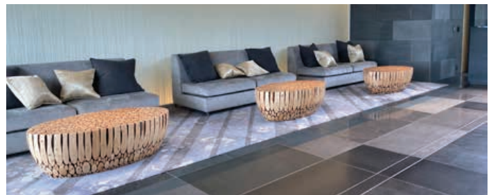
Canadian functional art warms up the ANA Intercontinental Hotel in Beppu, Japan