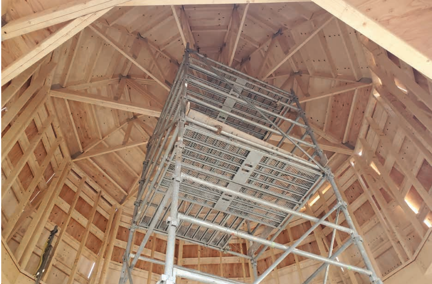
Yuyukai Social Welfare Corporation's nursing home project, Takamatsu