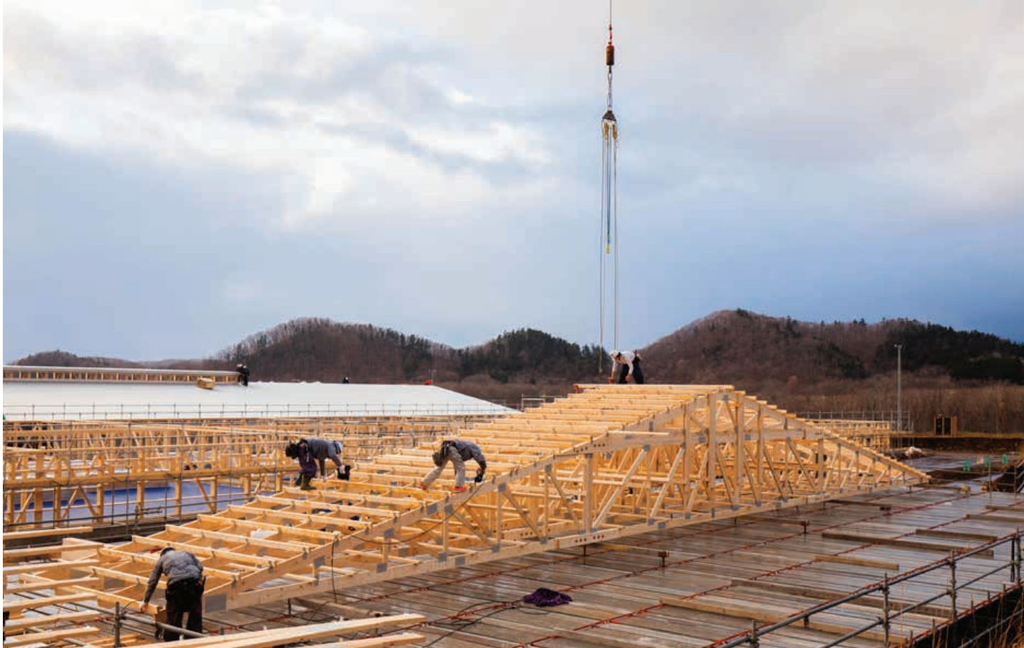
Erimo Pig Farm, Hokkaido prefecture