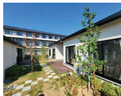
Nursing Home Nakano Nukumori no Sato