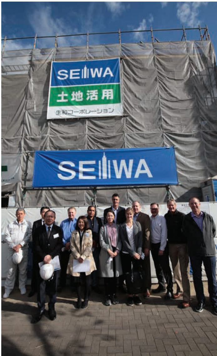
Seiwa 2x4 multi-family apartment building, Chiba prefecture

strong, up 10 percent from the previous decade, reaching 55.6 percent in 2022. Both 2x4 and post-and-beam multi-family construction have grown over this time frame. Performance-based fire code regulatory changes increasingly facilitate the use of wood-frame construction for mid-rise and tall wood construction, creating additional market opportunities for Canadian lumber and panel products.