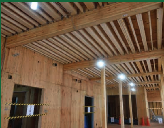
Sakura Hospital

Opened in November 2022, the facility is one of the largest hospitals in Japan to be designed and built using the 2x4 construction method and roof trusses. The three-storey hospital (33 beds) has a total floor area of 2,677 m 2 and incorporates over 400 m 3 of structural wood products, including S-P-F dimension lumber and engineered wood joists and floor beams. The structure's carbon storage equivalent is estimated at 474 tonnes of CO 2 .