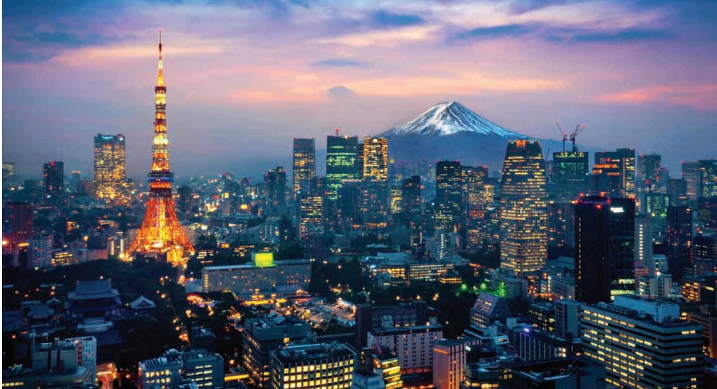
Aerial view of Tokyo cityscape with Fuji mountain in Japan.