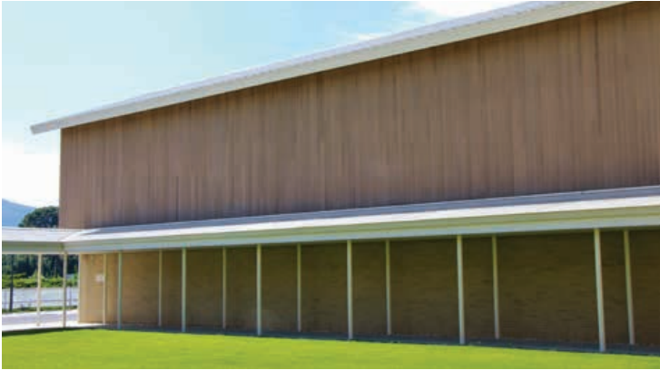
Western red cedar invites tourists into the Kanosuke Distillery in southern Japan

Japan remains a high-priority market for Canadian value-added manufacturers due to the large housing market and the historical affinity for wood use. Niche market opportunities are available for the value-added sector, such as in tourism, where products made in the distinctive, traditional B.C. coastal design have particular appeal.