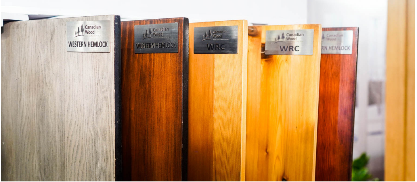
Canadian wood samples