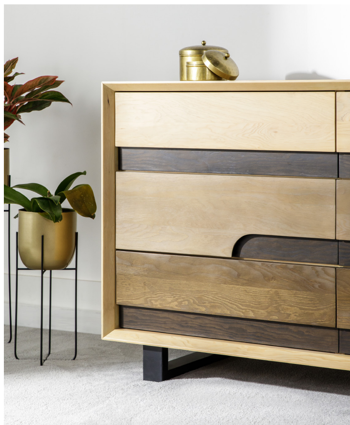
Western hemlock product trials