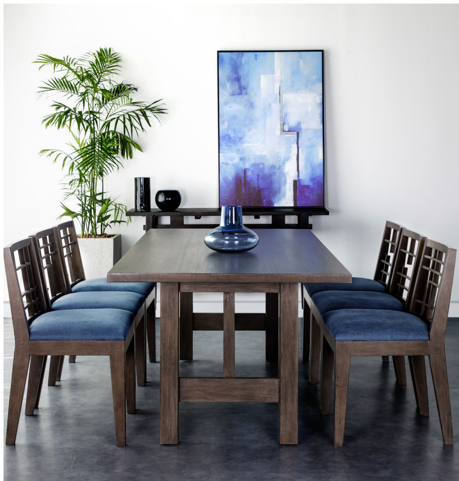
Hemlock furniture trials made for the “Try Canadian Wood” program