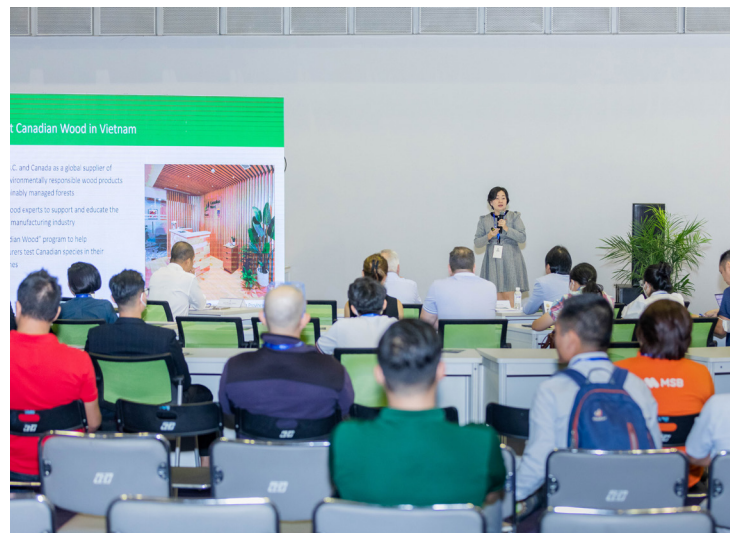
Vietnam trade shows