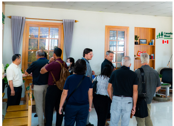
2022 industry mission to VietnamWood