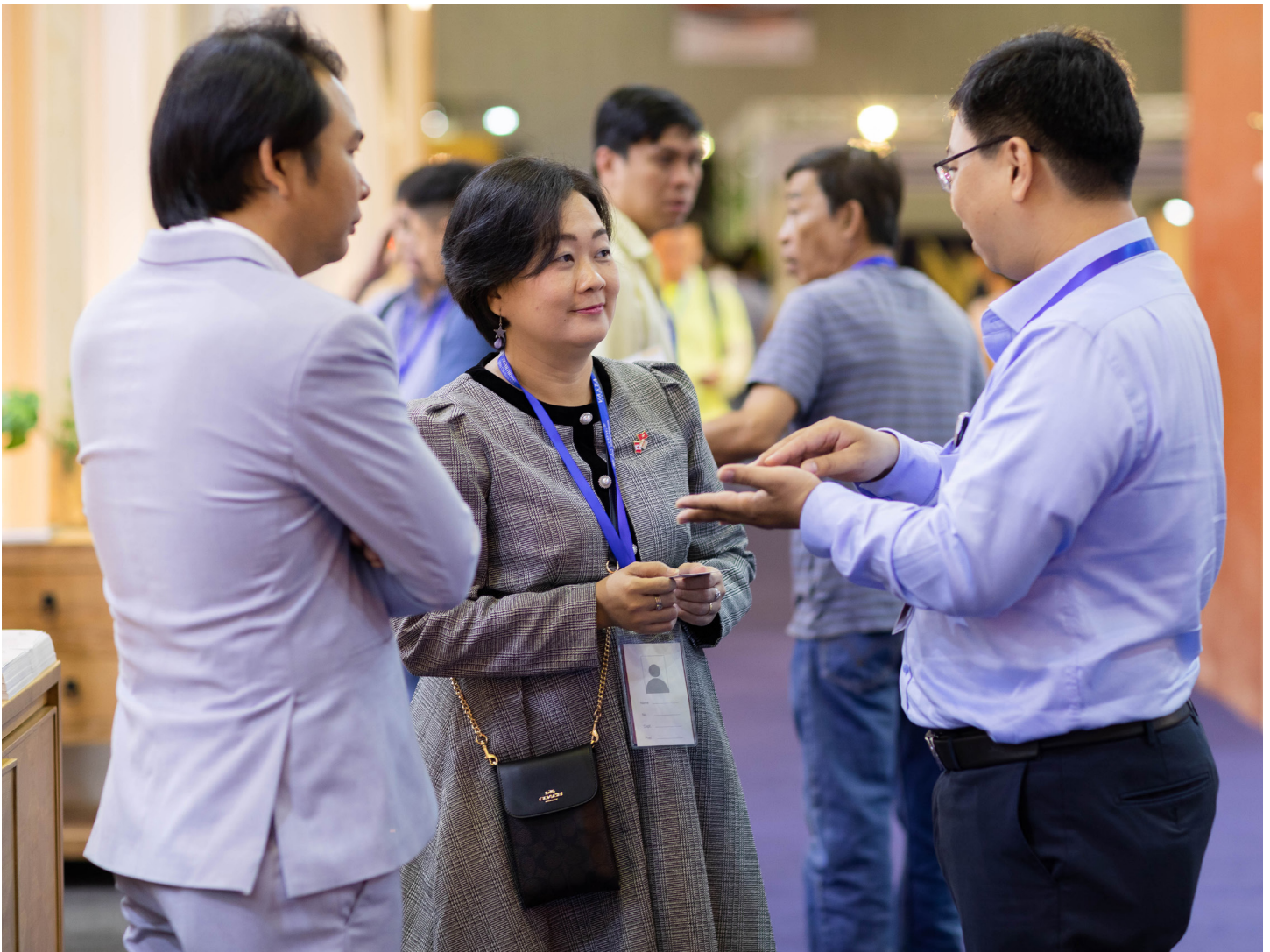
HAWA Expo 2023

In 2022, FII established an office in a major furniture manufacturing district near Ho Chi Minh City. FII's team in Vietnam is focused on expanding business development opportunities in the manufacturing industry in the southern region of the country, which is home to over 4,000 major furniture factories, employing anywhere from several hundred to over 10,000 workers per facility.